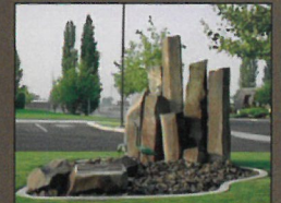
City of Othello

Basalt flows and ice-age floods shaped the predominate geologic features of the Columbia River Basin. Incorporate this heritage into your garden with basalt columns, paths of basalt gravel, and other garden features made of basalt; flood-tumbled rock;