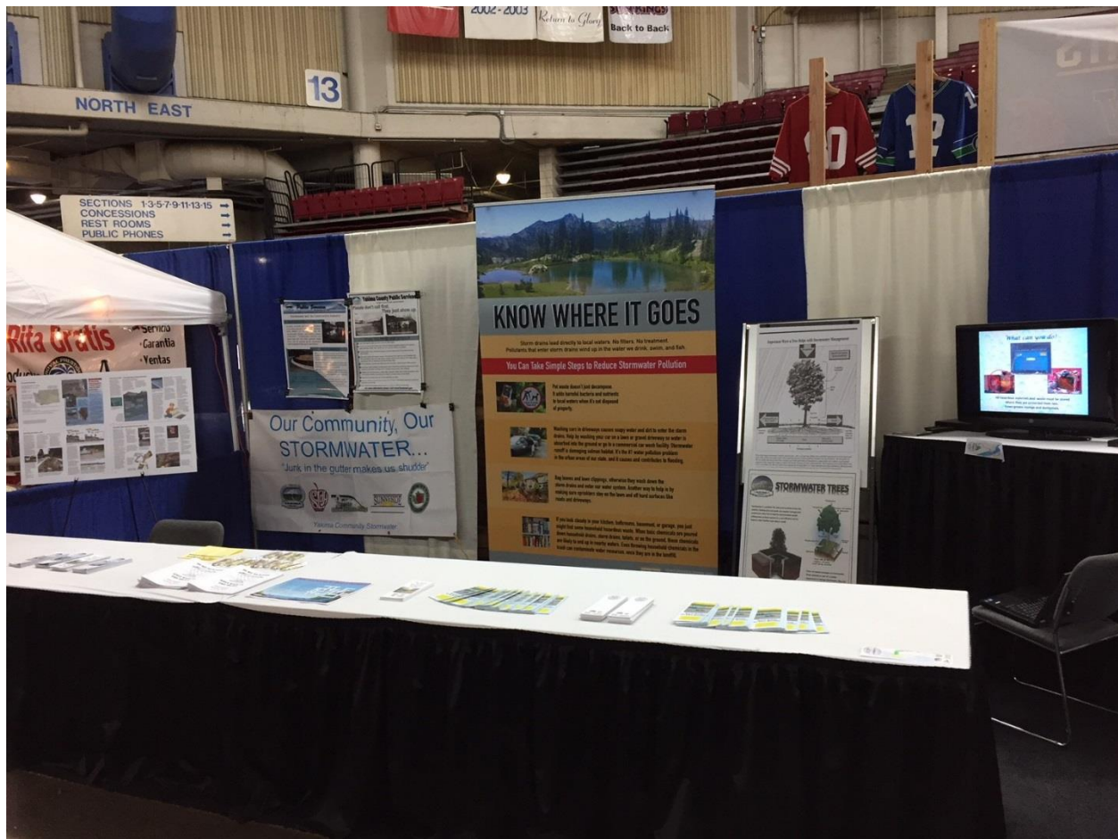
Figure 4. 2018 Central Washington State Fair Booth.

materials already developed that target sources of stormwater pollution such as construction site trackout and other forms of illicit discharge are always available, in English and Spanish, to our co-permittees and through our stormwater outreach website for dissemination. Brochures and newsletters are also available at the front counter of Public Services Department offices that provide details on BMPs and recent stormwater activities.