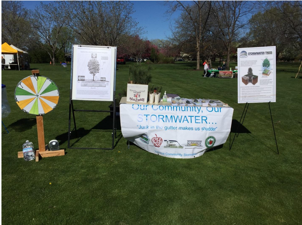
Figure 3. 2018 Arbor Festival Educational Station at the Yakima Arboretum.

The regional stormwater program reached out to children and the public in 2018 during the Central Washington State Fair (CWSF); which provides a booth annually for stormwater education. RSWG and Co-permittee's staff manned the booth, along with staff from the Yakima Nation and the City of Yakima, and provided a large quantity of stormwater education and awareness give-away items for a broad range of target markets. Staff were available to answer questions about the stormwater program and educate the public on how to identify and report illicit discharges.