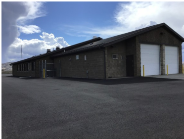
STATION 22 1830 Harrison Rd. Yakima, WA 98901