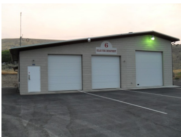
STATION 26 121 Fink Rd. Selah, WA 98942