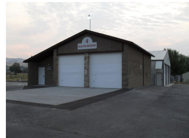
STATION 24 4251 N. Wenas Rd. Selah, WA 98942